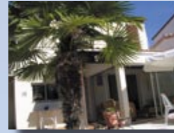
Ref : 2792 Spacious four bedroomed villa situated close to the golf course. Reception area, large living room with chimney, veranda, kitchen and utility room. Large front garden with terrace. Rear terrace with access to the park. Ideal home from home ! Price : € 367,000