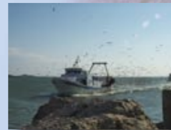
Ref : 2841 PALAVAS Spacious four bedroomed villa situated very close to the town centre. Enclosed planted garden. South-west facing. Garage and two parking spaces. Price : €330,000