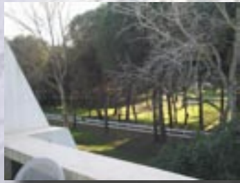
Ref: 2467 One bedroomed apartment with sunny terrace. Beautiful and calm residence. Golf course view. Price : € 166,000