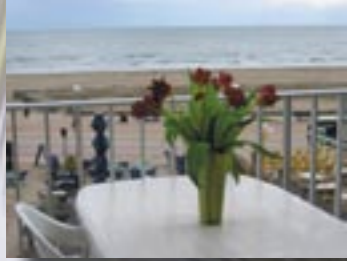
Ref : 2678 One bedroomed apartment with cabin in very good condition. Beautiful sea and beach views. Private parking. Price : € 200,000