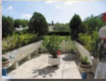
Ref : 2795 Large ground floor apartment situated in a well kept residence with concierge. Two bedrooms, bathroom, independent kitchen, spacious south facing living room. Terrace, swimming pool and garage. Only minutes away from the beautiful sandy beaches of the Mediterranean! Price : € 320,000