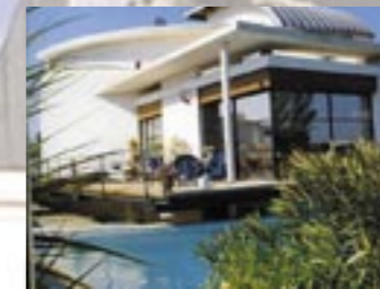
Ref : 2628 Amazing villa situated in the heart of La Grande Motte's golf course. Beautifully presented throughout. Five bedrooms, four bathrooms, open plan living room – dining room. Swimming pool. Large underground garage. Amazing views assured. Price : €1,150,000