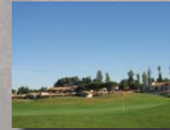
Ref : 2849 Beautifully renovated, one bedroomed terraced house situated close to the golf course. Residence with swimming pool. Parking. Price : € 166,000