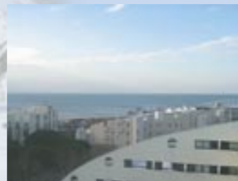
Ref : 2845 Bright and spacious three bedroomed apartment situated on the top floor. Large living room, two bathrooms and beautiful kitchen. South facing. Terrace 85m 2 . Garage. Price : € 598,000