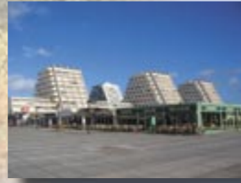
Ref : 2825 Large town centre studio situated in a residence of standing. Kitchen independent, spacious living room with adjoining bedroom and bathroom. Loggia 10m 2 with park view. Price : € 145,000