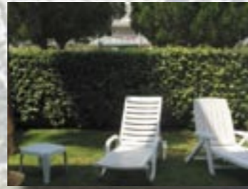
Ref : 2743 Spacious ground floor apartment. Two bedrooms with ample storage space, fitted kitchen, large living room. Two terraces and garden of 130m 2 . Secured residence. Private parking. Ideal to live in all year round. Price : € 365,000