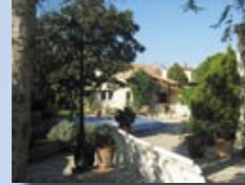
Ref: 2852 LUNEL Beautifully presented throughout, this villa has all the characters of the south. Spacious living room/ dining room with large chimney and gallery. Air-conditioning throughout. Swimming pool with a summer kitchen, an independent studio with kitchenette, shower room and separate toilet. Planted and well maintained gardens. Garage.