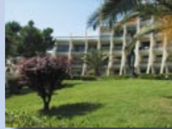
Ref : 2702 One bedroomed apartment situated very close to the beach and shops. South facing terrace with garden view. Price : € 129,000