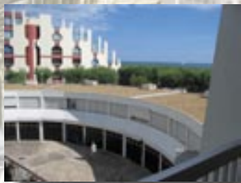
Ref : 2745 For sale one bedroomed apartment with cabin situated very close to the beach. Spacious terrace. Underground parking. Price : 164,000