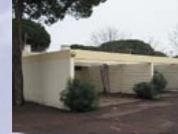
Ref : 2866 Villa totally renovated, one bedroom, office, shower room and spacious living room with an American kitchen. Sunny terrace. Parking. Price : €270,000