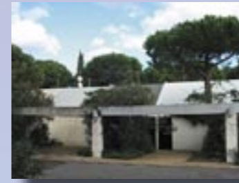
Ref : 2771 Beautifully presented two bedroomed villa situated close to the town centre. Large terrace. Parking for two cars. Price : € 230,000